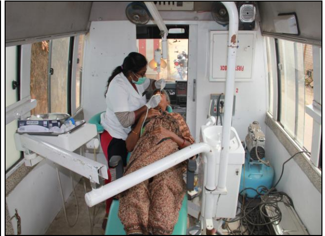
Doctor's verifying the patients