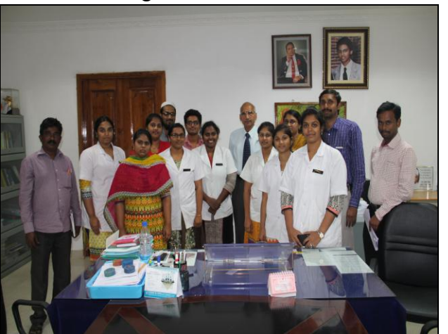
Team of Doctors with Director, Director (Infra) and NSS Programme Officer