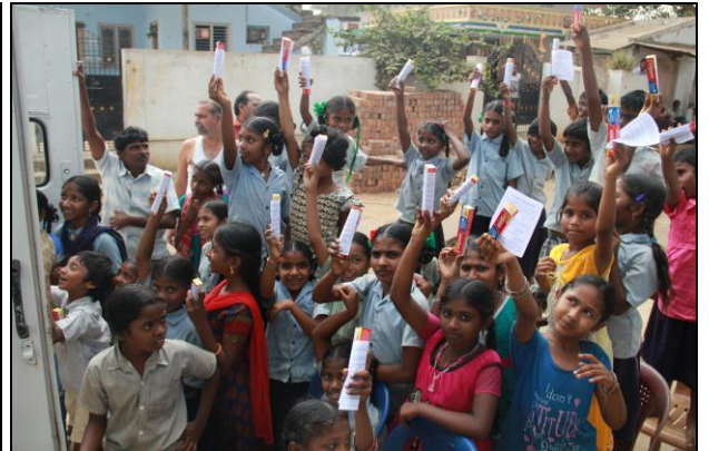
Doctor's verifying the patients and MPUP School Children's showing the dental kits